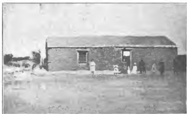
AN EARLY SOD SCHOOL HOUSE.